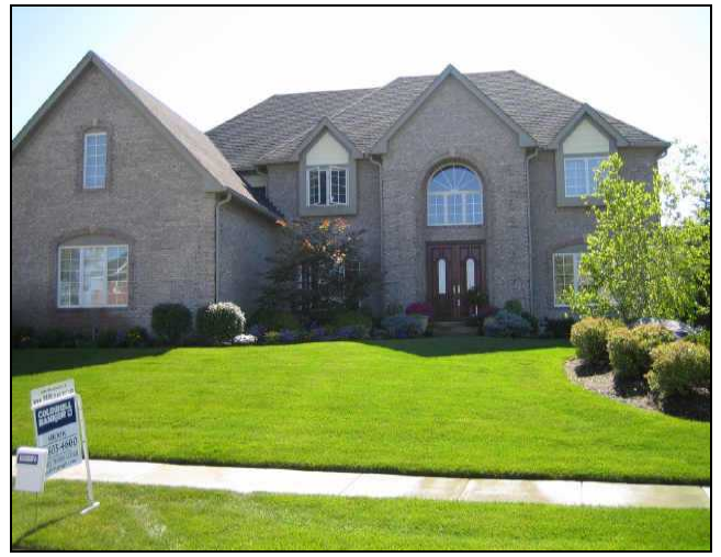
Listing Firm: Coldwell Banker - Kaiser

Lot Info: Cul-De-Sac, DockAccess, Sidewalks