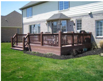
Listing Firm: Coldwell Banker - Kaiser

This former model features many upgrades, including granite counter tops, crown molding on 1st/2nd levels, tray ceilings, built-in bookcases, office desk shelving, semi-custom cabinets, heating & cooling upgrades, tile patterns, stainless steel appliances & stereo speaker system. The Master Bedroom Suite is huge & boasts a separate sitting room w/fireplace & wet bar, fantastic master bath & 22x15 walk-in closet.